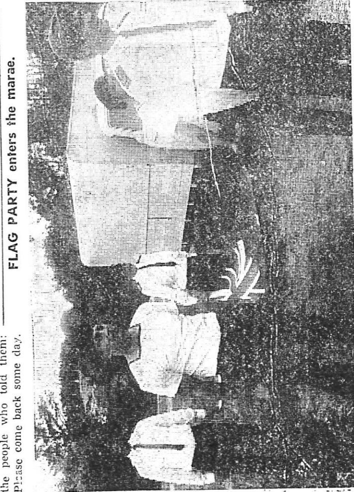
FLAG PARTY enters the marae.

Conditions permitting, the exercise will be held this coming Sunday, December 5, and the public are reminded that the fire siren will be sounded during the exercise.